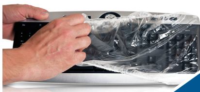
1. Apply Keyboard Cover